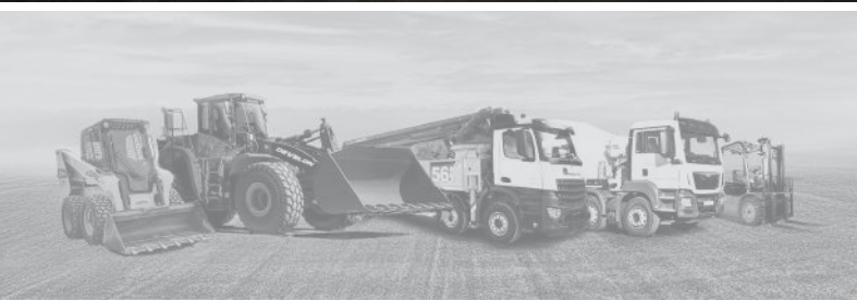
PARTS & INDUSTRIAL SUPPLIES DIVISION