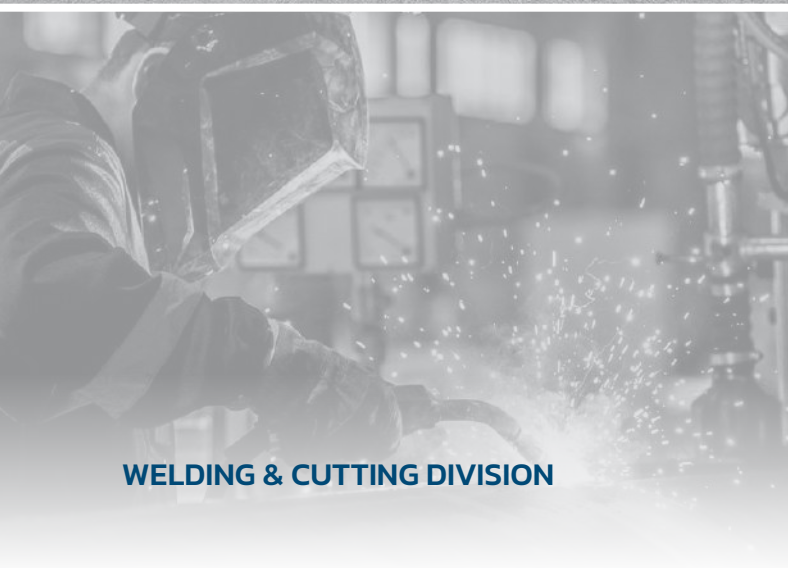
WELDING & CUTTING DIVISION