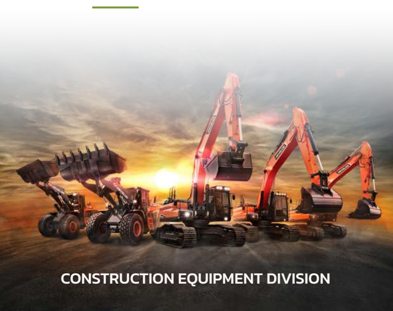
CONSTRUCTION EQUIPMENT DIVISION