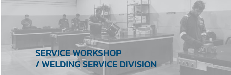
SERVICE WORKSHOP / WELDING SERVICE DIVISION