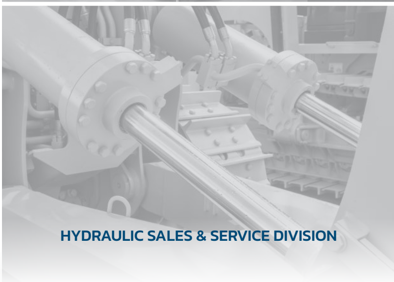
HYDRAULIC SALES & SERVICE DIVISION