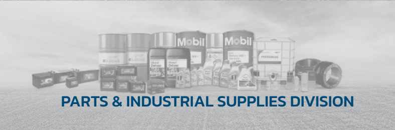
PARTS & INDUSTRIAL SUPPLIES DIVISION