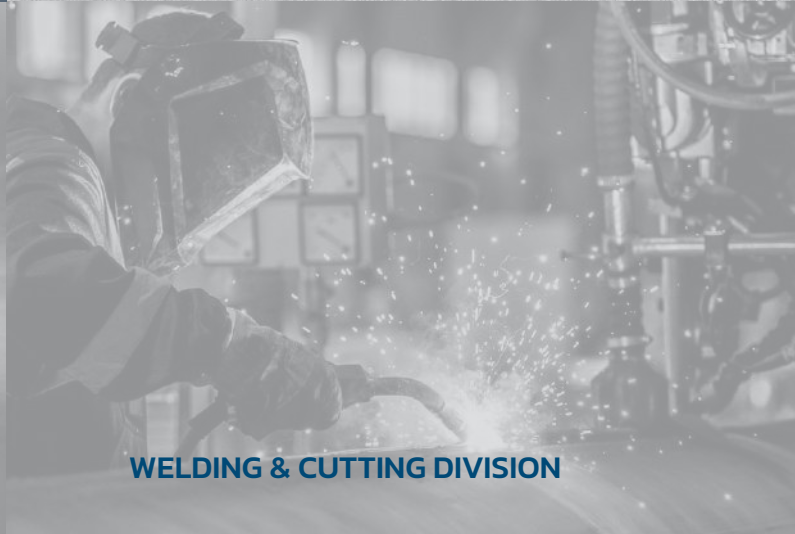
WELDING & CUTTING DIVISION