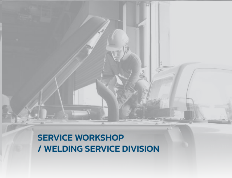
SERVICE WORKSHOP / WELDING SERVICE DIVISION