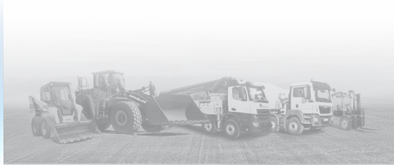
PARTS & INDUSTRIAL SUPPLIES DIVISION