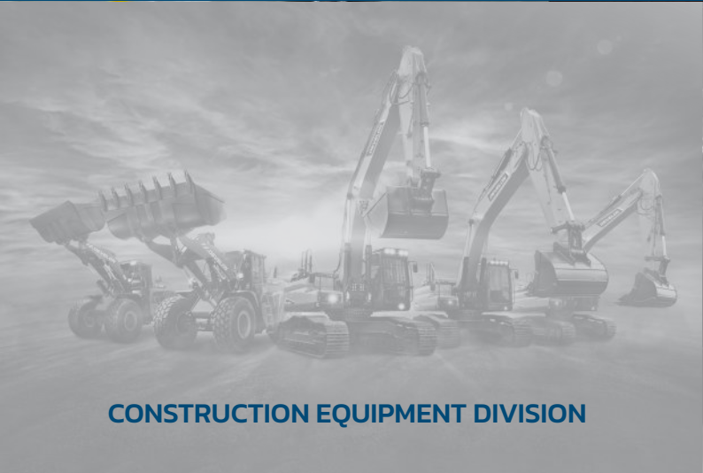
CONSTRUCTION EQUIPMENT DIVISION