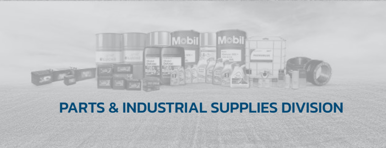
PARTS & INDUSTRIAL SUPPLIES DIVISION