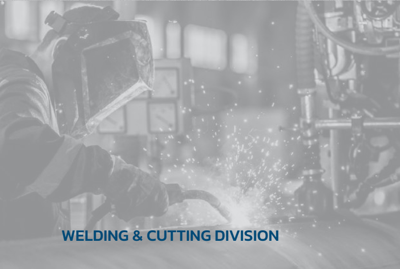
WELDING & CUTTING DIVISION