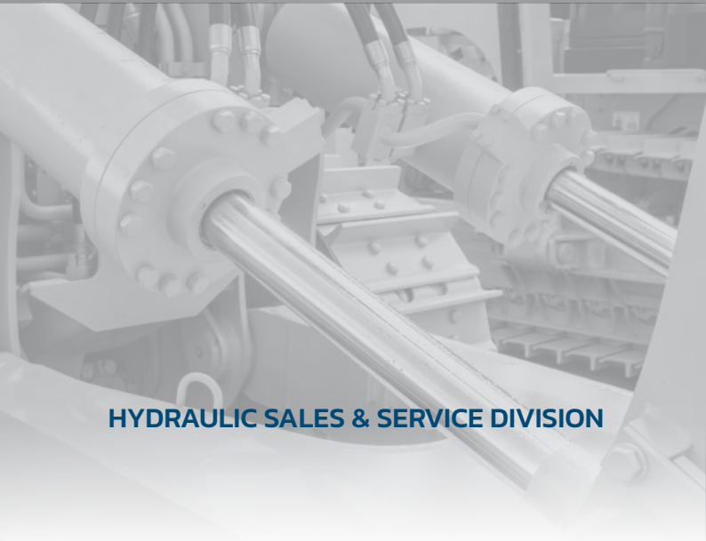
HYDRAULIC SALES & SERVICE DIVISION