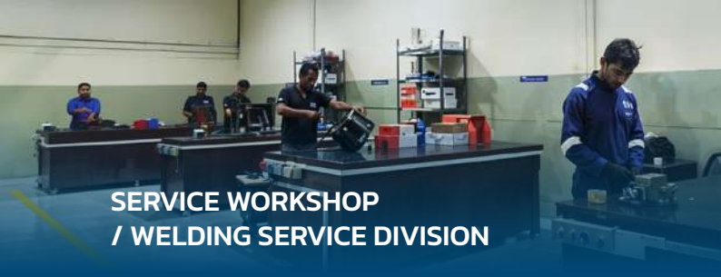
SERVICE WORKSHOP / WELDING SERVICE DIVISION