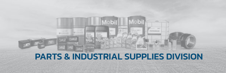
PARTS & INDUSTRIAL SUPPLIES DIVISION