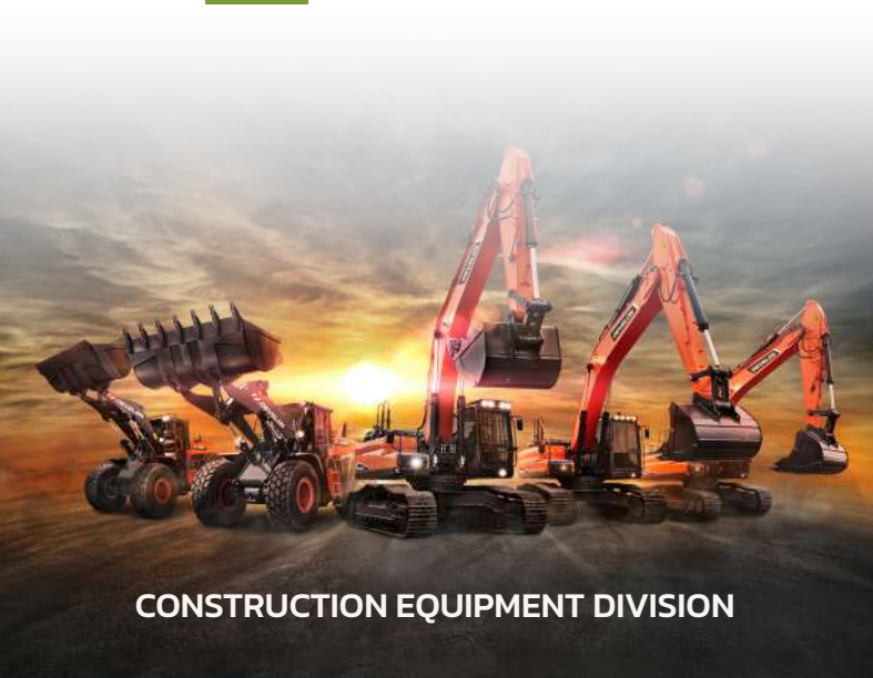
CONSTRUCTION EQUIPMENT DIVISION