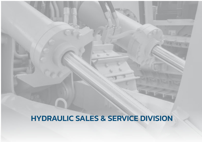
HYDRAULIC SALES & SERVICE DIVISION