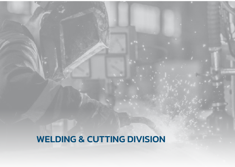
WELDING & CUTTING DIVISION